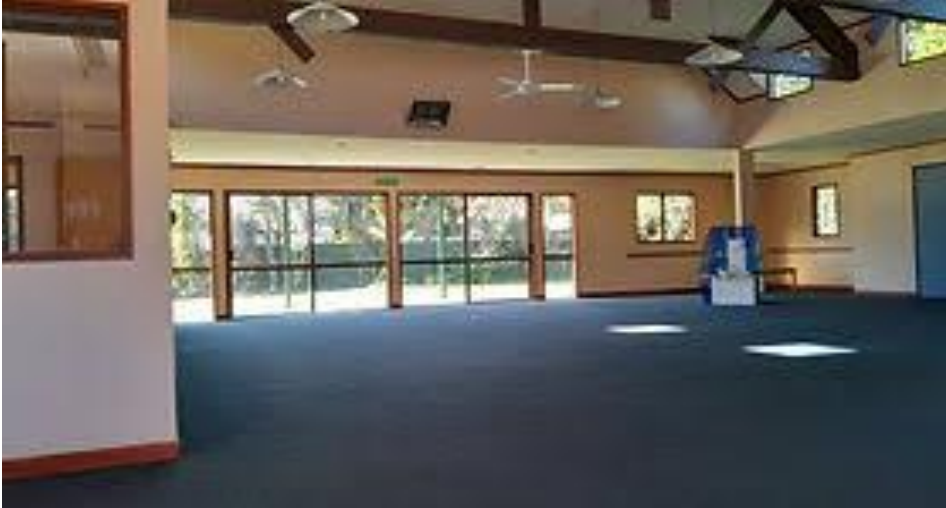
Image: TCV Hall before it was furnished and decorated